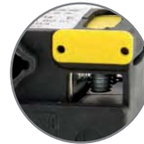
Sealable plastic cover