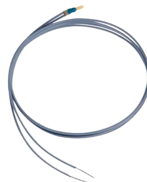
PTC 120 /160